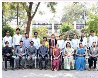
Principal and Staff with Academic Council

Student participated in Pharma cup Cricket tournament.