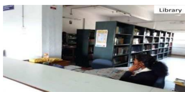
Library Facility for the entire Institution