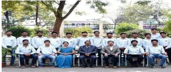
Principal and Staff with College Cricket Team

Student participated in Badminton Tournament, also participated in various athletics like Shot put, Discus Throw, 100 meters. running. Also student participated in Badminton Tournament organized by RTMNU, Nagpur.